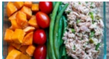
Sweet potato, green beans & tuna salad