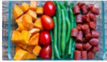
Sweet potato, green beans & smoked sausage