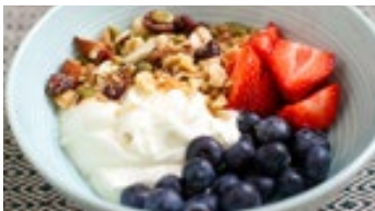
Yoghurt, nuts & fruit bowl