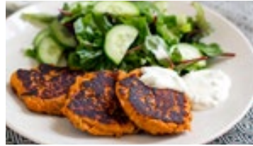
Salmon fish cakes & salad with jalapeño aioli