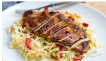
Cajun chicken & coleslaw