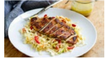
Cajun chicken & coleslaw