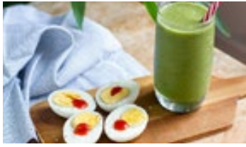
Green smoothie & two hard-boiled eggs