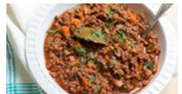
Bolognese with zucchini noodles