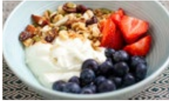
Yoghurt, nuts & fruit bowl