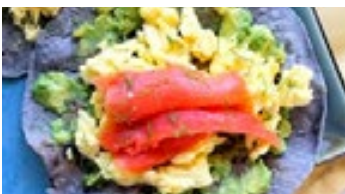
Eggs with smoked salmon & avocado