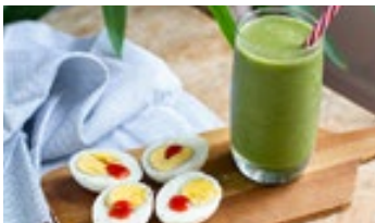
Green smoothie & two hard-boiled eggs