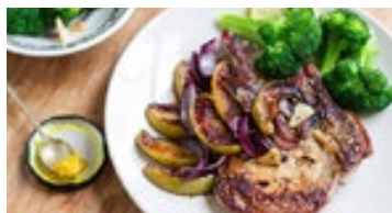
Fennel pork cutlets with apples, onion & broccoli