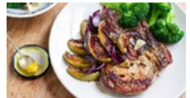
Fennel pork cutlets with apples, onion & broccoli