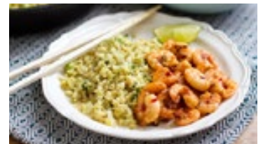
Honey garlic prawns with cauliflower celery rice